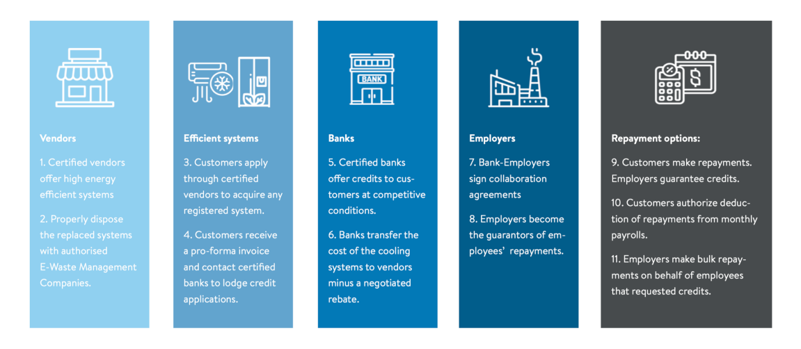
Figure 2. Roles and responsibilities in the green on-wage financing mechanism

The success of the model depends mostly on the interest and engagement of the local financial institutions and their number of existing profiled employer institutions.