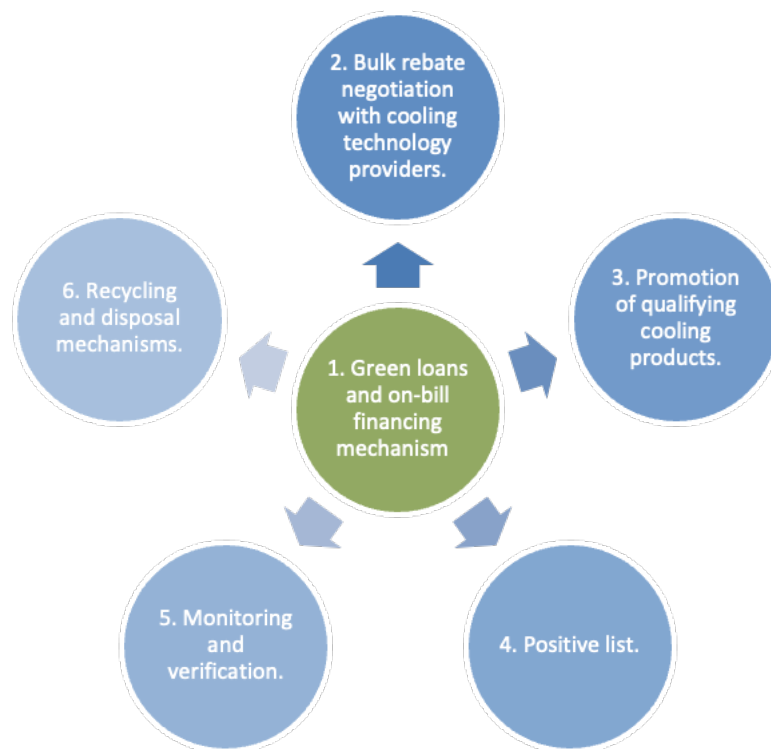
Figure 1. Financial and non-financial components of on-bill financing mechanism

Proposed structuring of on-bill financing for Namibia. The following on-bill financing mechanism option including key components is proposed for further consideration in Namibia: