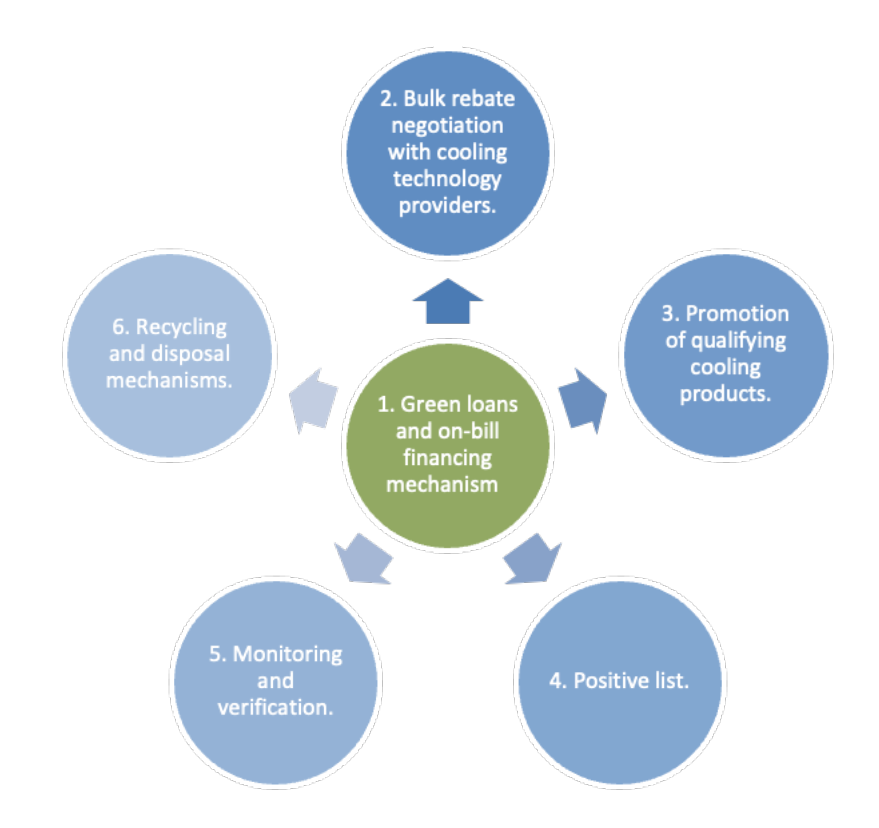
Figure 1. Financial and non-financial components of on-bill financing mechanism

1. Green loans and on-bill financing as a low-risk repayment mechanism. Zambia's banking system is competitive. Most of the banking institutions, as well as few microfinance institutions, offer consumer loans or credit facility, which are sought after by households to acquire movable equipment and appliances. In particular, consumer loans are intended more for employees who have a guarantee through the domiciliation of their remuneration, while the other applicants must present a guarantee acceptable to the banking institutions (collaterals). The terms and conditions differ from one institution to another. Consumer loans and credit facilities mainly target employed individuals or homeowners, who can more easily provide sufficient credit capacity or some collaterals, reducing the perception of risk for local financial institutions (LFIs), but limiting the attractiveness of such a product for self-employed or non-salaried households.