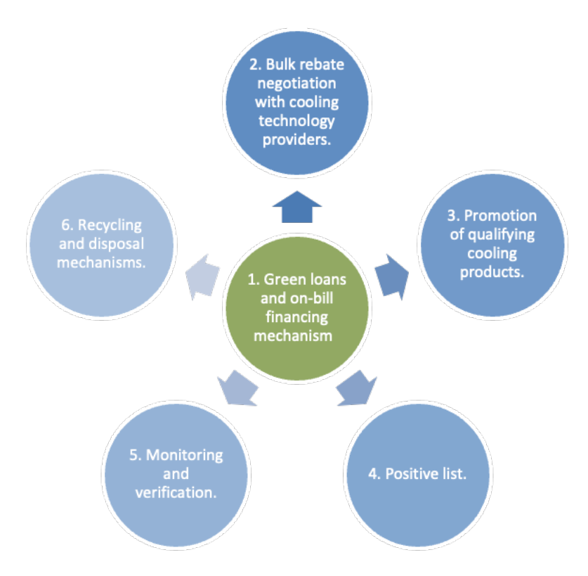
Figure 2. Financial and non-financial components of on-bill financing mechanism

Proposed structuring of on-bill financing for Zimbabwe. The following on-bill financing mechanism option including key components is proposed for further consideration in Zimbabwe: