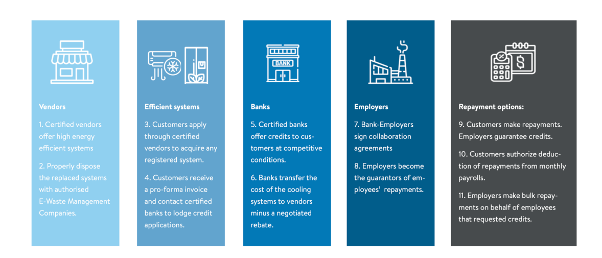
Figure 3. Roles and responsibilities in the green on-wage financing mechanism

The success of the model depends mostly on the interest and engagement of the local financial institutions and their number of existing profiled employer institutions.